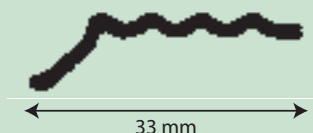
MT12 – Senior

Recommended for use domestically on floors with height variances of up to 5mm.