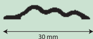
MT11 – Rippled

Recommended for use domestically with vinyls or similar with heights of up to 3mm.