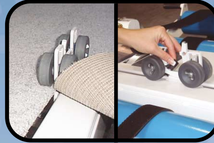
FAST, STRAIGHT CUTS

Patented, two direction, chain driven cutter uses standard blades and applies pressure to the material being cut. Get a straight, clean cut every time!