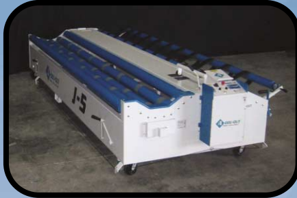
ONE PERSON OPERATION