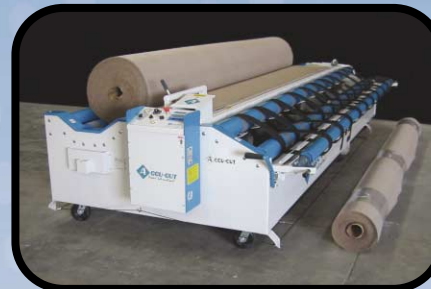
CUT PIECE REMOVAL

All Accu-Cut machines are equipped with a cut piece dumping mechanism to off load your cut length. Make multiple cuts off of one roll without using your forklift to remove the cut length!