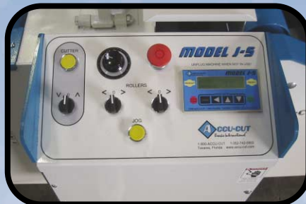
USER FRIENDLY CONTROLS

An auto-run feature makes operating the machine even simpler!