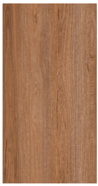
COASTAL SPOTTED GUM