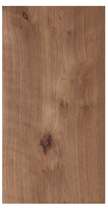
DESERT SPOTTED GUM