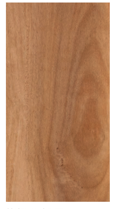
COASTAL BLACKBUTT Multi Shade Planks