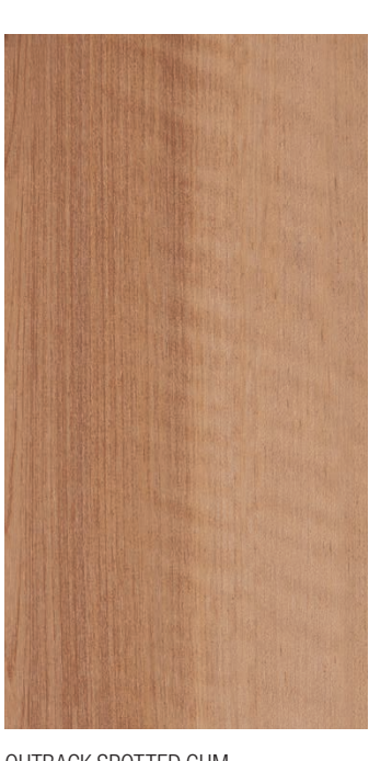
OUTBACK SPOTTED GUM